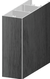
UltraBatten® 50mm x 150mm