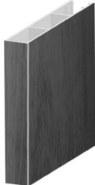
UltraBatten® 25mm x 150mm