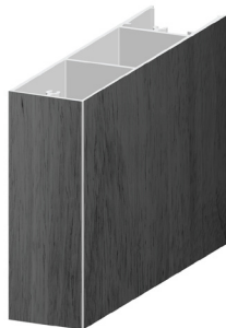
UltraBatten® 50mm x 200mm